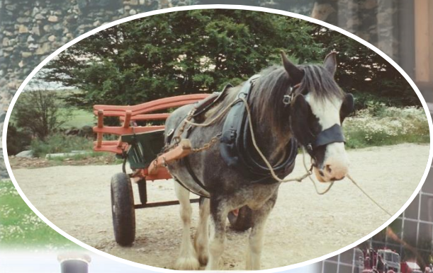
THE CLYDESDALE HORSE