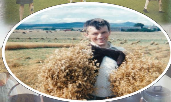
YOUNG AUTHOR ENJOYING STOOKING 1998