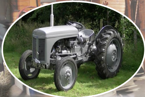
THE LITTLE GREY FERGIE